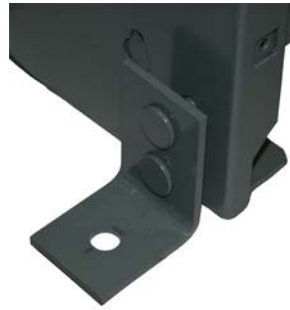
Table 14.9: Mechanical Lug Kits

Class 7400 / Refer to Catalog 7400CT0601