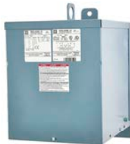
Style B—Type 3R Rated