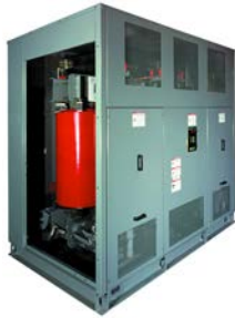
Power Cast II™

New! Revised Medium Voltage Transformer Energy Efficiency Information For 2016! In 2010 Schneider Electric released new efficiencies for MV transformers based on The Department of Energy (DOE) 10 CFR Part 431 Energy Conservation program for Commercial Equipment. We are now launching even more efficient transformers to further reduce energy consumption from MV transformers. Starting January 1, 2016 certain medium voltage distribution transformers with ratings of 2,500 kVA and below, 34.5 kV primary and below and 600 Vac class secondary voltages must meet revised minimum efficiency requirements. Liquid Filled Padmounts, Liquid Filled Substations, Dry Type VPI and Power Cast products shipped after January 1, 2016 will all be included. The minimum efficiency tables are listed below. Please contact your nearest Schneider Electric Sales Office for more information. Page 14-19 and 14-20 includes our updated offer.