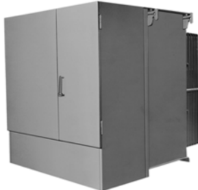
Liquid Filled Pad Mounted