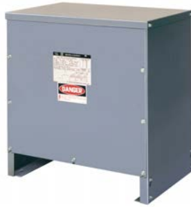
Style E—IP55 Rated

These dimensions are not for construction. Contact your local Schneider Electric representative for certified prints.