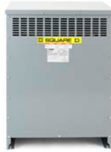
Style M—Type 2 Rated Converts to Type 3R with Weathershield