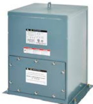
Style X—Type 4X Rated