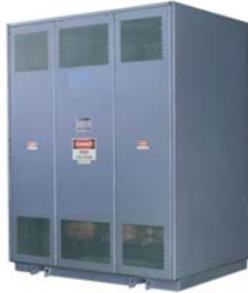
Style F—NEMA 1 Rated