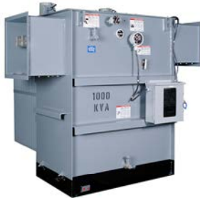
Liquid Filled Substation