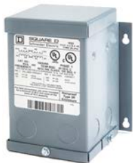
Style A—Type 3R Rated