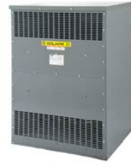
Style J—Type 1 Rated Converts to Type 2 with Drip Shield Converts to Type 3R with Weathershield