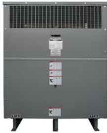
Style D, NEMA 1 Rated