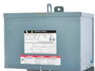
Style C—Type 3R Rated