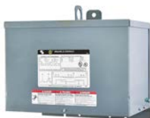
Type T and Type TF