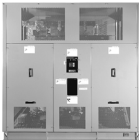
Power Dry II™