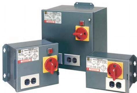
Transformer disconnects are available in NEMA Type 1 Standard, NEMA Type 12 Standard, and NEMA Type 1 Mini.

Square D™ brand transformer disconnects mount inside or outside a control system enclosure. The transformer disconnect being connected directly to the 480 Vac system controls power for auxiliary, single-phase loads when the main three-phase disconnect is either ON or OFF. The transformer disconnect is normally wired to the line side of the control panel's main disconnect.