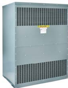
General Purpose Dry Type 600 Volts and Below