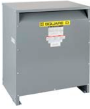
Style D and H—Type 2 Rated Converts to Type 3R with Weathershield